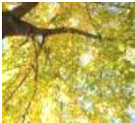
ABB is committed to attracting and retaining dedicated and skilled people and offering employees an attractive, global work environment.