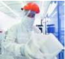
ABB helps customers improve their operating performance, grid reliability and productivity while saving energy and lowering environmental impact.