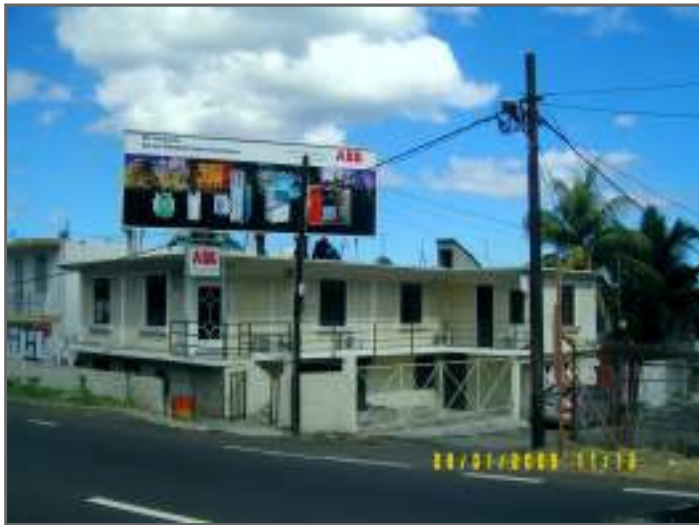
ABB Mauritius Headquarters – Port Louis