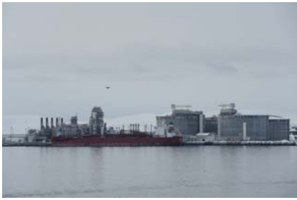
Melkoya 06_CREDIT ABB.jpg

Statoil's gas treatment plant and LNG (liquefied natural gas) factory at the island of Melkøya outside the city of Hammerfest (2012).