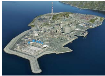
Melkoya 02.jpg

The slug catcher is where the well stream "surfaces" and is the first process step on the way to the final products LNG (liquefied natural gas), LPG (liquefied petroleum gas) or condensate (light oil), which is being produced at Statoil's gas treatment plant and LNG factory on the island of Melkøya outside the city of Hammerfest (2010).