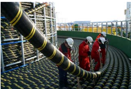
ABB Subsea cables_01.jpg

Production of subsea cables at the ABB factory in Karlskrona, Sweden is a time and space consuming process. Cables are uploaded to cable laying vessels ready to start the installation process.