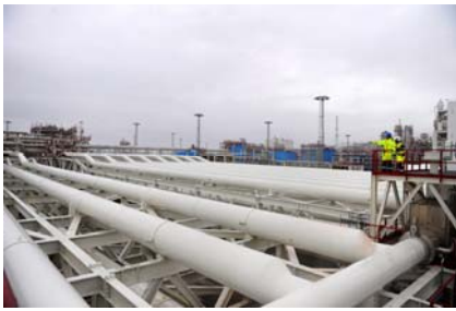
Melkoya 03.jpg

The slug catcher is where the well stream "surfaces" and is the first process step on the way to the final products LNG (liquefied natural gas), LPG (liquefied petroleum gas) or condensate (light oil), which is being produced at Statoil's gas treatment plant and LNG factory on the island of Melkøya outside the city of Hammerfest (2010).