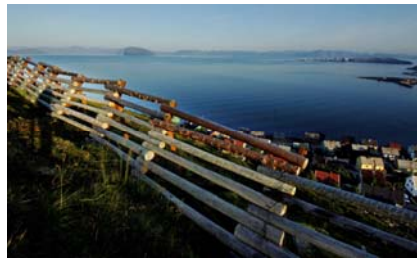
Hammerfest 03_CREDIT ABB.jpg

Snow barriers in the hillside above the city of Hammerfest, set up to prevent avalanches during winter. In the upper left corner the famous Håja island, and in the upper right corner Statoil's gas treatment plant and LNG (liquefied natural gas) factory at the island of Melkøya (2006).