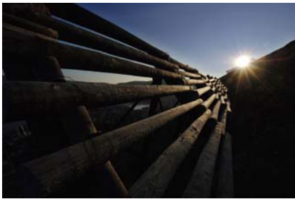
Hammerfest 04_CREDIT ABB.jpg

The land of the midnight sun: Snow barriers in the hillside above the city of Hammerfest, set up to prevent avalanches during winter (2006).