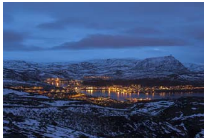
Hammerfest 07_CREDIT MORTEN BRAKESTAD_ABB.jpg