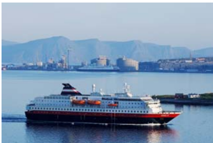
Hammerfest 01_CREDIT ABB.jpg

MS Nordlys, one of the ships of Hurtigruten, the Norwegian coastal ship operator, entering the port of Hammerfest. In the background Statoil's gas treatment plant and LNG (liquefied natural gas) factory at the island of Melkøya (2006).