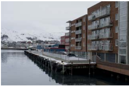
New ABB office in Hammerfest

New ABB office in Hammerfest is the world's northernmost ABB location. The ABB office is in the building on the right (2012).