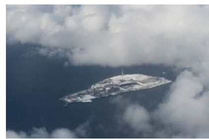
Melkoya 01.jpg

Statoil's gas treatment plant and LNG (liquefied natural gas) factory at the island of Melkøya covered by snow, outside the city of Hammerfest, seen from the air (2012).