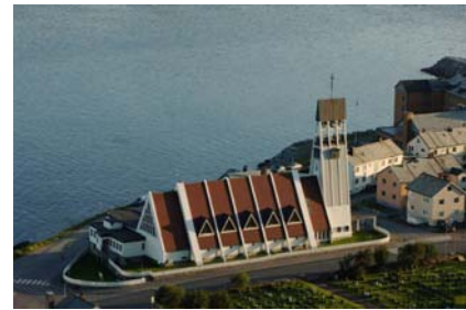
Hammerfest 02_CREDIT ABB.jpg