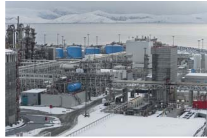
Melkoya 08_CREDIT ABB.jpg

Statoil's gas treatment plant and LNG (liquefied natural gas) factory at the island of Melkøya outside the city of Hammerfest (2012).