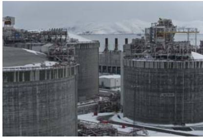
Melkoya 07.jpg

Statoil's gas treatment plant and LNG (liquefied natural gas) factory at the island of Melkøya outside the city of Hammerfest (2012).