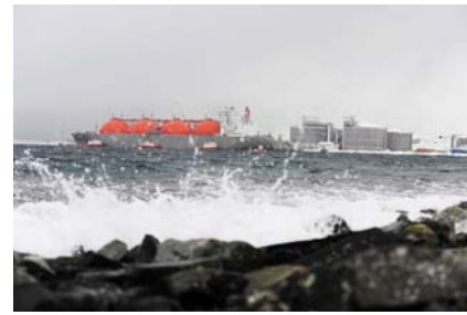
Melkoya 04.jpg

Statoil's gas treatment plant and LNG (liquefied natural gas) factory at the island of Melkøya outside the city of Hammerfest. An LNG tanker is at port loading natural gas (2009).