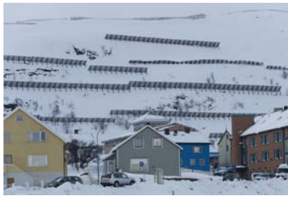
Hammerfest 06_CREDIT ABB.jpg

The city of Hammerfest covered in snow. On the hillside, snow barriers set up to prevent avalanches during winter (2012).