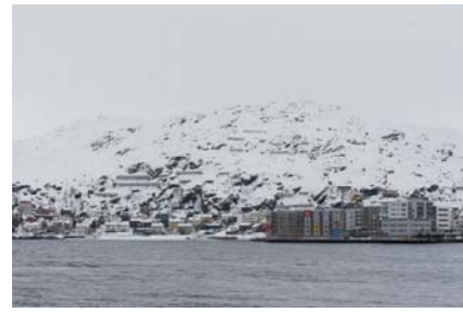
Hammerfest 05_CREDIT ABB.jpg

The city of Hammerfest covered in snow (2012).