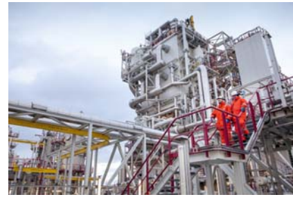
Melkoya 11_CREDIT MORTEN BRAKESTAD_ABB.jpg

ABB engineers at work on Statoil's gas treatment plant and LNG (liquefied natural gas) factory at the island of Melkøya outside the city of Hammerfest (2010).