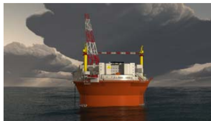
Goliat 01.jpg

An illustration of the Goliat floating production storage and offloading (FPSO) unit, easily recognizable with its characteristic cylindrical shape, which is a Sevan 1000 FPSO design.