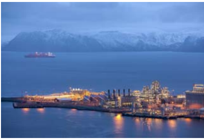
Melkoya 10_CREDIT MORTEN BRAKESTAD_ABB.jpg

Statoil's gas treatment plant and LNG (liquefied natural gas) factory at the island of Melkøya outside the city of Hammerfest. The LNG tanker in the background is waiting to start loading natural gas (2010).