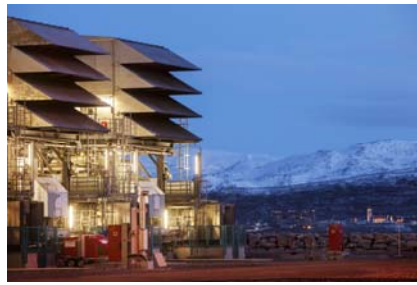
Melkoya 12.jpg

Statoil's gas treatment plant and LNG (liquefied natural gas) factory on the island of Melkøya outside the city of Hammerfest. In the background, Hammerfest's characteristic church (2010).