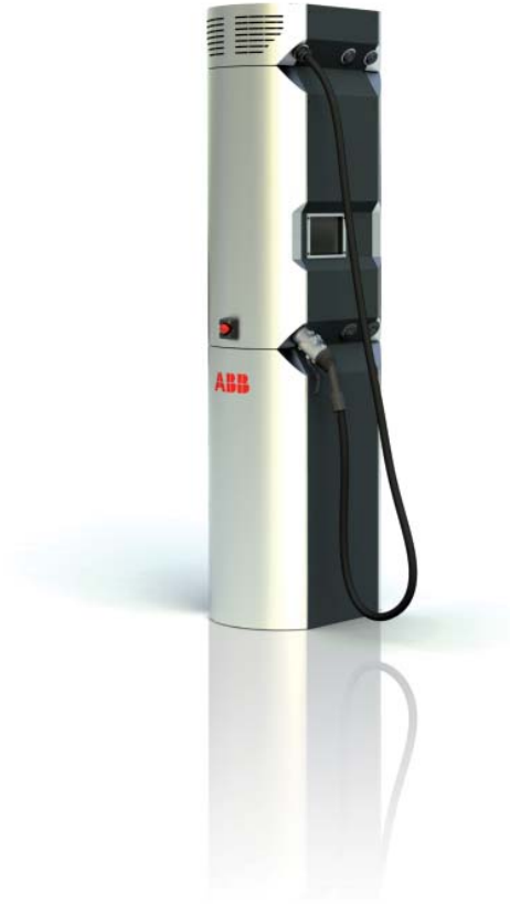
ABB DC fast charge stations will allow rapid recharging of electric vehicles. Depending on the battery and vehicle type, recharged range of greater than 100km in less than 10min is readily achievable. As battery technology advances further, recharging will become available with the speed and simplicity of a fuel stop.

ABB Power Electronics moves to deliver advanced offboard vehicle charging solution. High power for rapid recharging, enabling long distance travel and eliminating range anxiety.