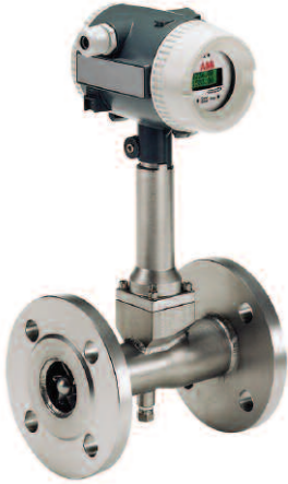
Offering high accuracy and low maintenance, ABB's swirl meters are ideal for steam metering applications

Steam metering throughout the entire distribution system is crucial for good energy management. Proper metering allows operators to see exactly what's going on. For example, meters can track the consumption of individual user processes across a site. This enables energy managers to encourage efficiency by introducing separate billing, or target energy saving measures where they will have the most effect. Trend information also enables operators to spot malfunctioning equipment or other problems as they develop.