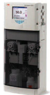
ABB's new Navigator 600 silica analyser

Typical parameters include: conductivity , pH , dissolved oxygen , sodium , silica , hydrazine , phosphate , ammonia and chloride .