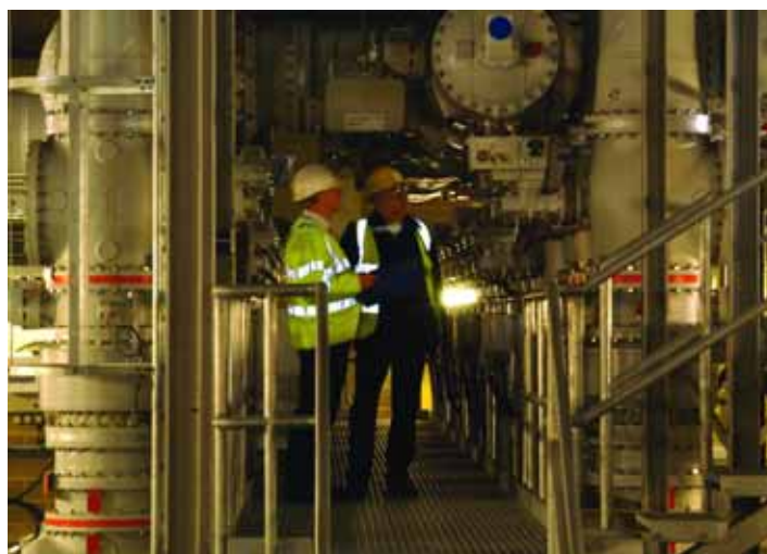
The extension will include four more ABB GIS switchbays.

The extension will also see additional cable diversion work to connect the substation to the new indoor GIS substation that ABB has constructed in west London, together with an interconnection to a local MESH substation and connection to EDF Energy's 132kV substation.