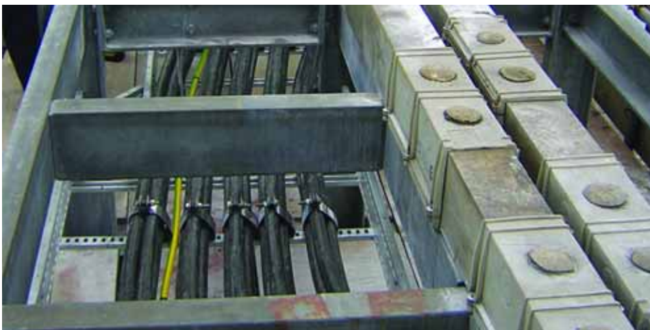
Busbar circuits have been replaced with XLPE cable.

disturbance to customers, ABB will carry out the installation work in a number of phases co-ordinated with National Grid's planned outage programme.