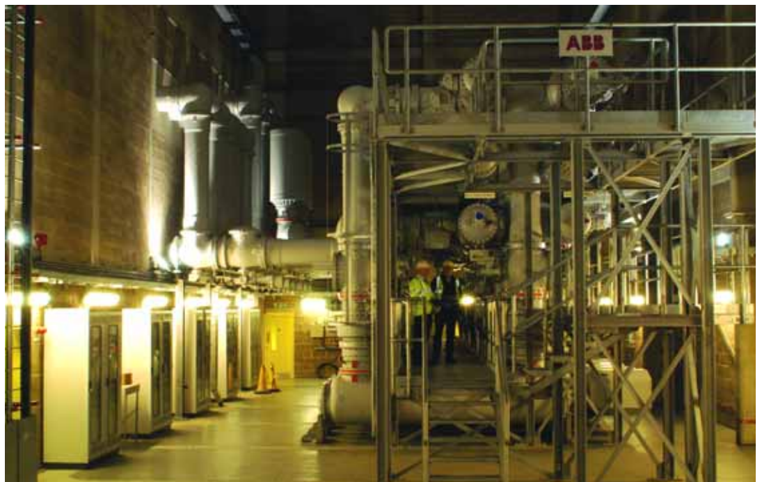
An in-built mezzanine floor makes GIS servicing easier and safer.

In essence, what we are challenging our designers to do is to think a little different, and step back to see the bigger picture. So that instead of the immediate traditional answer, they can develop a solution that contributes to improving the safety of the whole project – not just for those constructing it, but also for those using and maintaining the facility years from now.