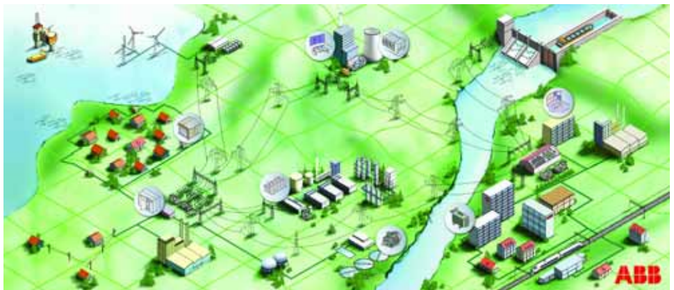
ABB's technology portfolio covers the full landscape of power transmission and distribution activities.

generation, networks and demand side solutions of the future with you. We are confident that together we can not only move towards a shared vision, but can also improve your operational efficiency and bottom line.