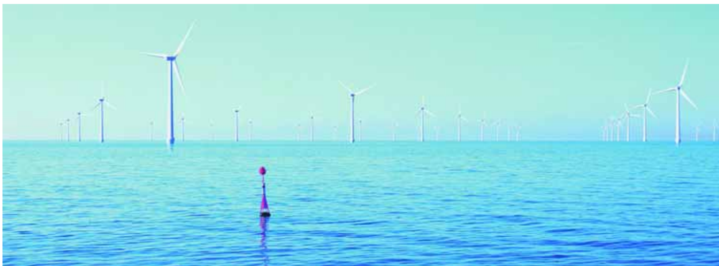
The first phase of Supergrid will involve some 2,000 wind turbines.

Supergrid is an ambitious project that could help to solve an impending energy crisis in Europe. Proposed by the renewable energy company, Airtricity and actively supported by ABB, the first phase of the sub-sea Supergrid will cost around £15 billion to create. Eventually running from Spain to the Baltic Sea, the network will link national grids as well as delivering power from offshore windfarms.