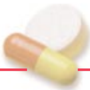
ABB Process Control Systems – Reliable and Validatable

What characteristics must a control system, PLC, or DCS have in order to make its use permissible in a facility which is subject to a validation requirement?